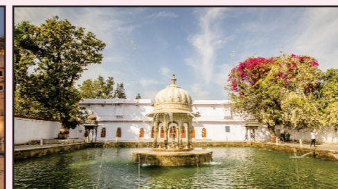
Saheliyon Ki Bari